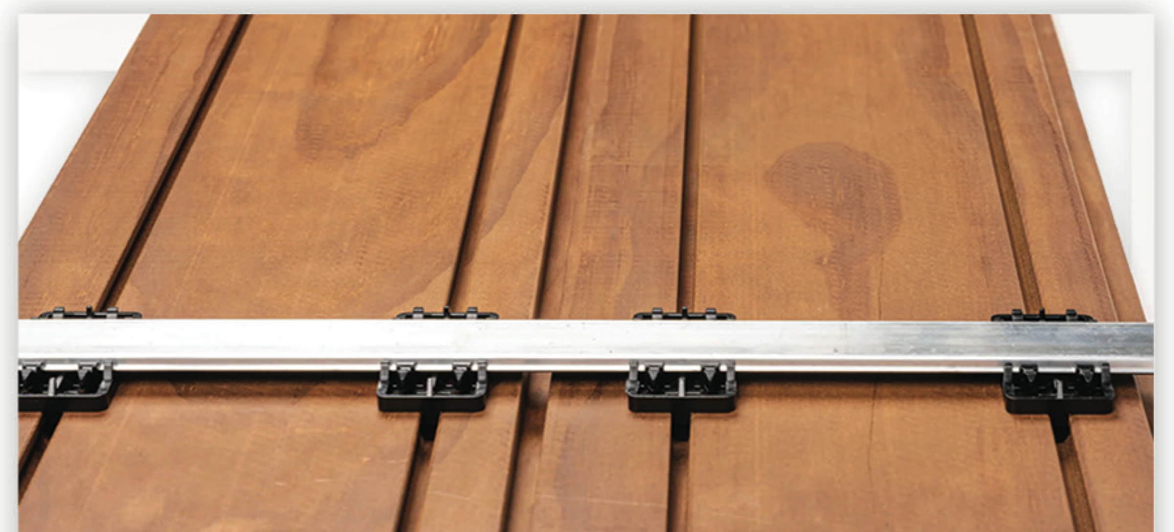
Millwork & Grooving System